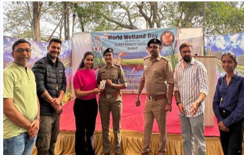
Core Committee member presenting a memento to The Forest officer.